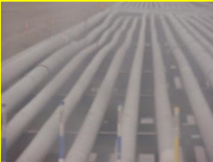
The pipes connect to the pipeline.