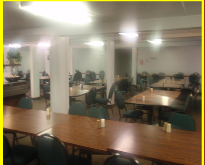
This is the Arctic Caribou Inn