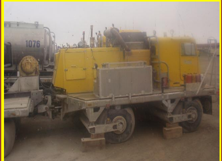
These wheels are designed for the tundra.

The Prudhoe Bay Oil Field is highly secure.