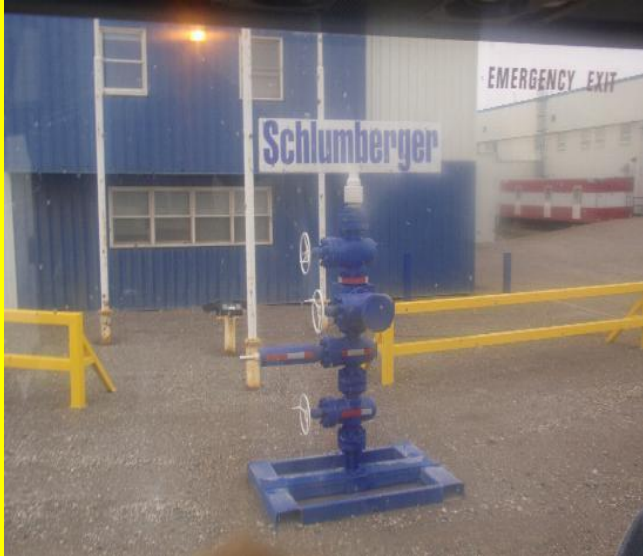
This valve is called a Christmas Tree.