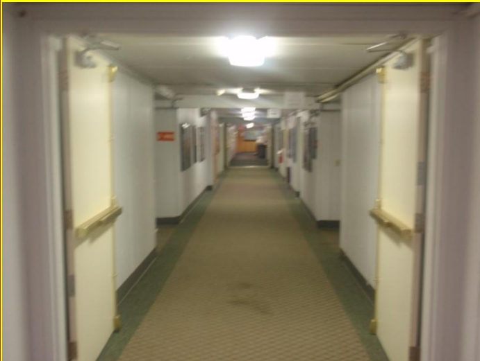
The inn is made up of ATCO trailers.