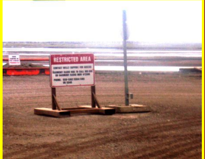
The field is a very restrictive area.