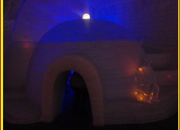
These are pictures from the Ice House in Chena Hot Springs- about 100 miles northeast of Anchorage. The house is kept at 20 degrees winter and summer.